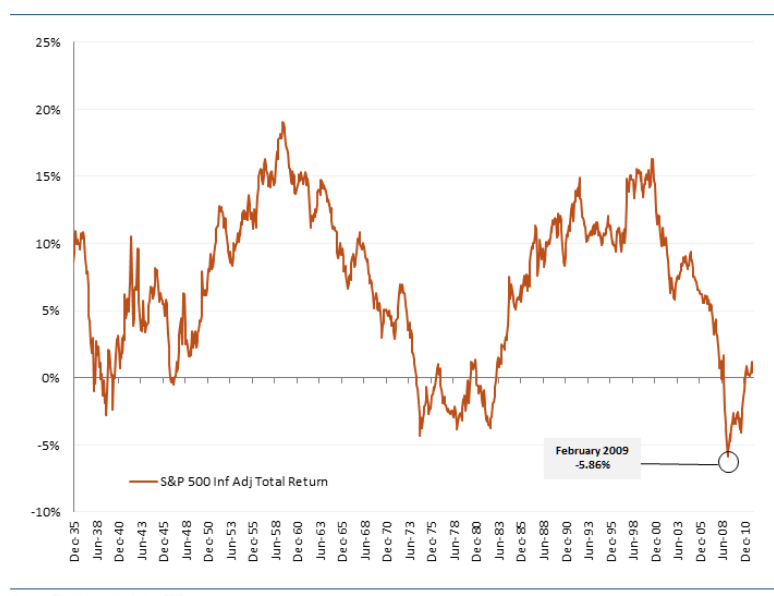
Exhibit 2: S&P 500 Rolling 10-Year Average Annual Inflation Adjusted Total Return as of 12/31/2011

VENUS SI 48°39.084' N / 123°29.1735' W 95.5m